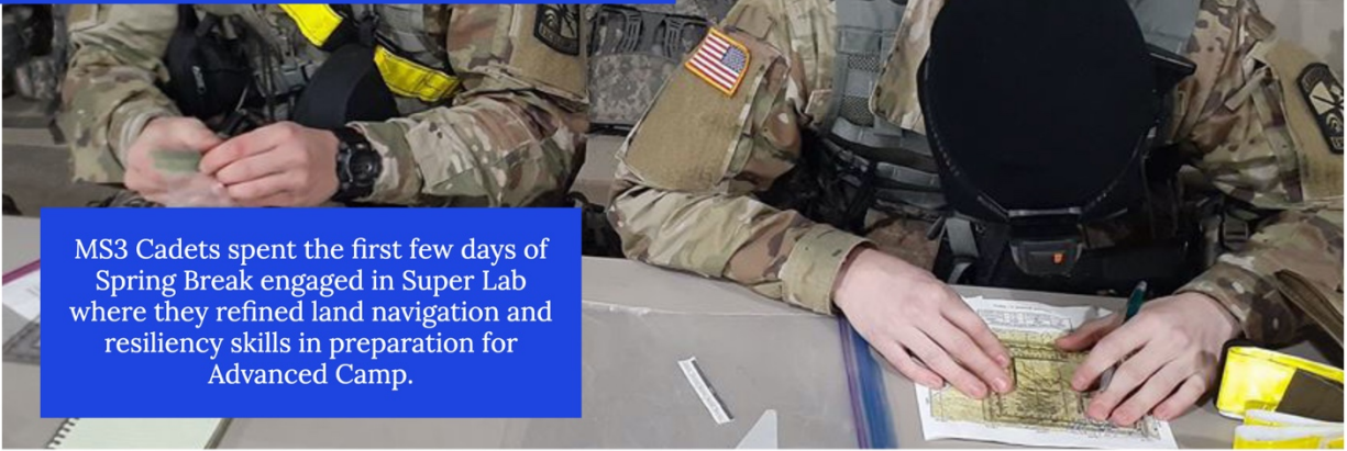
MS3 Cadets spent the first few days of Spring Break engaged in Super Lab where they refined land navigation and resiliency skills in preparation for Advanced Camp.