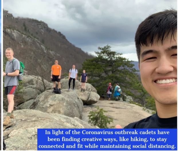
In light of the Coronavirus outbreak cadets have been finding creative ways, like hiking, to stay connected and fit while maintaining social distancing.